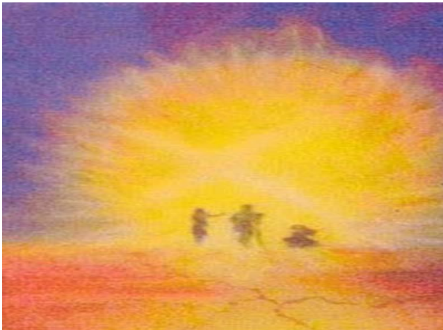
Transfiguration Sunday, The Last Sunday after Epiphany February 15 th